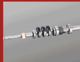
更好零件确保更高性能 More reliable spare parts ensure higher performance