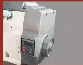
一体节能电机：高效，稳定 Integrated energy-saving motor: efficient & stable

This model is an integrated energy-saving direct drive, super high speed overlock sewing machine. Direct drive needle bar is suitable for sewing uniform, pajama, sports wear etc. medium and heavy duty material. The design of integrated control system and machine body saves the room and lower down the energy consumption. Optional device of auto trimmer, auto presser lifter etc. can improve the sewing performance.