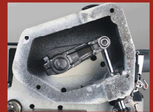
针杆直接驱动，吃厚性能好 Direct drive needle bar, higher performance in sewing heavy duty.